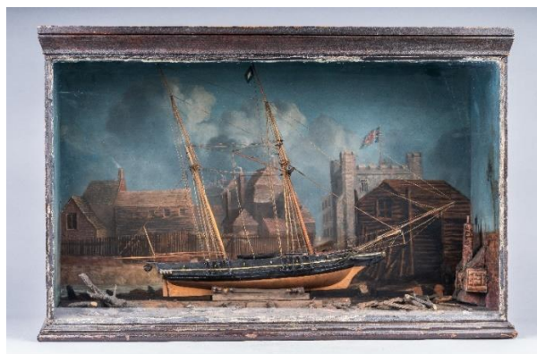
Model of shipyard at South Gate, by King's Lynn-born Thomas Baines, a recent photograph taken of items on display at Lynn Museum.

Adding images to the museum's online catalogue continues to be a priority and staff at Lynn Museum will be spending a third day in September working with photographer David Kirkham to take new pictures of items on display in the main gallery at the museum. These images will be shared through the Norfolk Collections website, social media, museum website and in other ways as part of the work to engage with the public with collections knowledge.