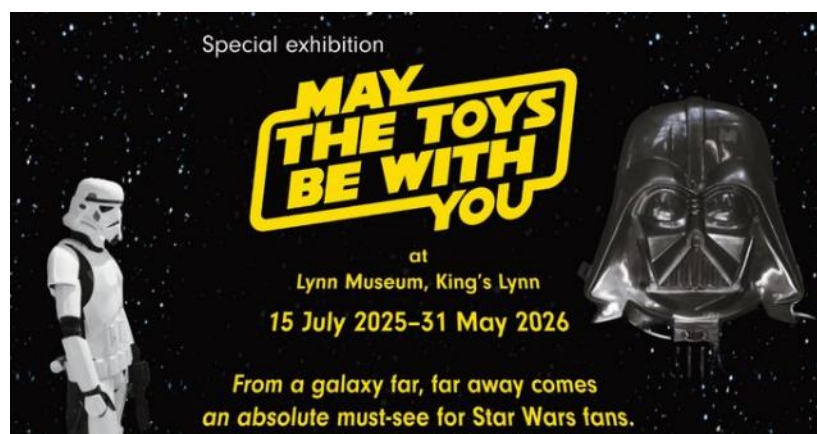
Marketing design for the current Star Wars themed exhibition at Lynn Museum.

The current exhibition at Lynn Museum, which opened in July, is May the Toys be with You . It showcases one of the UK's finest collections of vintage Star Wars toys and original cinema posters, from 1977-1985. It is a celebration of the now highly collectable vintage toy line and of the iconic design work and art of the Star Wars movies. This exhibition opened at Lynn Museum on 11 July and will run until 31 May next year. The exhibition is aimed at developing audiences and is an opportunity to showcase aspects of the Lynn Museum collections including toys and games.