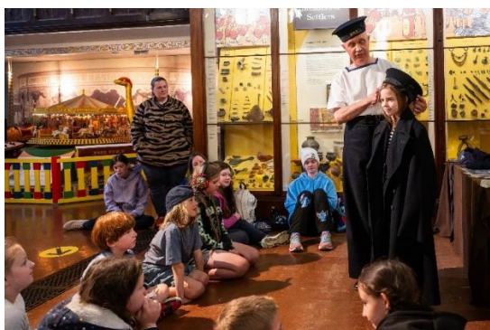
Children learning about maritime history at Lynn Museum