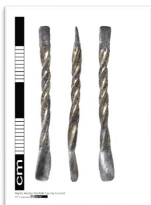
Gilded medieval ear scoop identified and recorded at a Lynn Museum finds event

favourite: https://finds.org.uk/database/artefacts/record/id/1176209