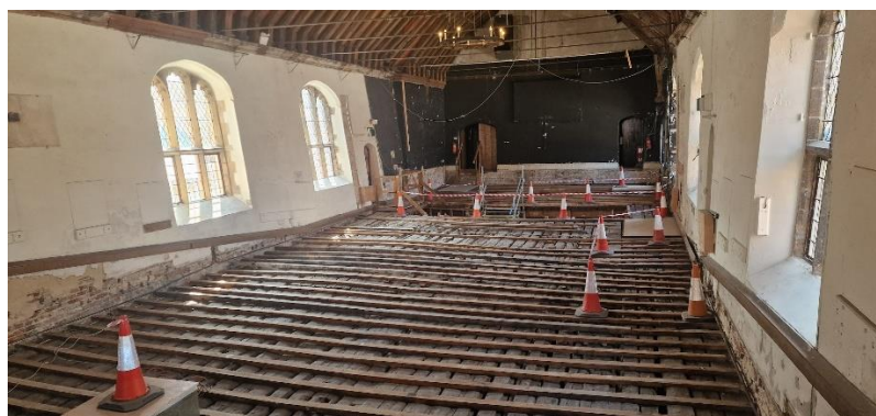
Medieval floor uncovered at St George's Guildhall.

NMS staff continue to support Borough Council colleagues with the development and delivery of relevant cultural and heritage projects across the Borough, including ongoing support for Towns Fund projects including the Guildhall project. A number of NMS staff support the ongoing work of the Guildhall project team and NMS is also represented on the Guildhall Project Board.