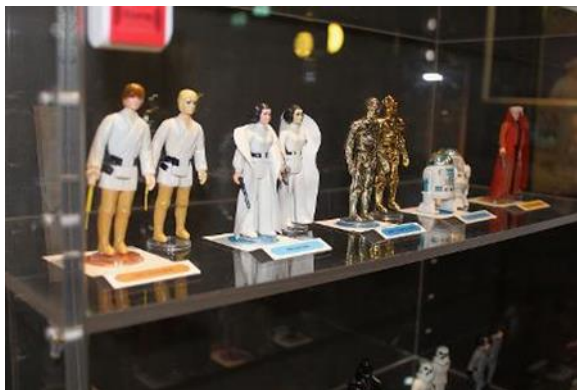
Original toys from the first Star Wars films, part of a collection on display at Lynn Museum

Star Wars toy collection goes on show at Lynn Museum | Eastern Daily Press